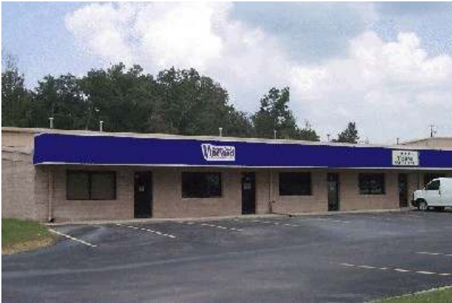
Pine Lane Office/Warehouse